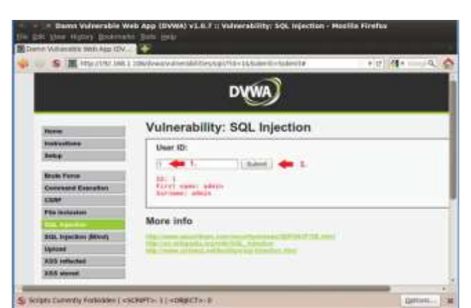
Fig2. SQL Injection Attack

9. Now we go further deep to explore the database by inputting the below text into the user ID Textbox as shown in the figure %' or '0'='0 and Click Submit.