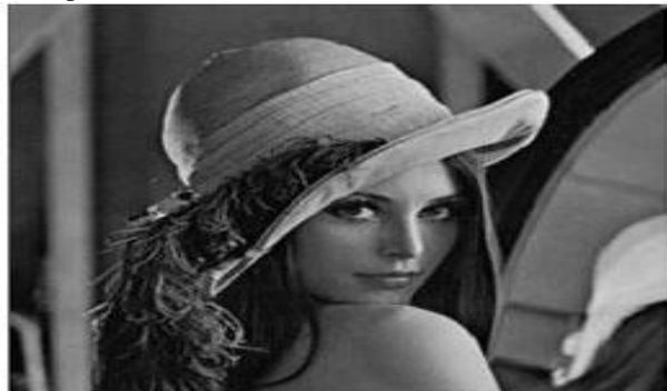
Fig.3: Grey scale

It is additionally named as an intensity, gray scale, or grey level image. Array of sophistication uint8, uint16, int16, single, or double whose component values specify intensity values. For single or double arrays, values vary from [0, 1]. For uint8, values vary from [0, 255]. For uint16, values vary from [0, 65535]. For int16, values vary from [-32768, 32767]. Image construction mistreatment detector and completely different image acquisition instrumentation denote the brightness or intensity I of the sunshine of an image as 2 dimensional continuous operate F(x, y) wherever (x, y) represents the abstraction coordinates once exclusively the brightness of sunshine is taken into account. generally three-dimensional abstraction coordinate are utilised. Image involving solely intensity are called grey scale pictures.