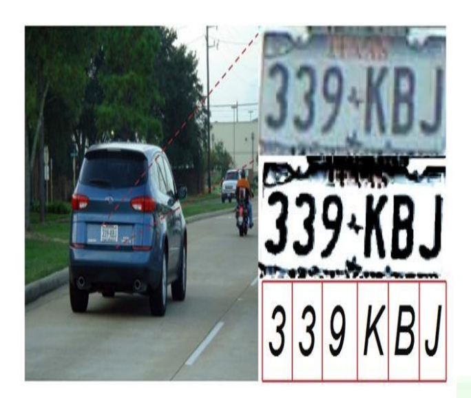
Fig.1: Vehicle Plate Recognition